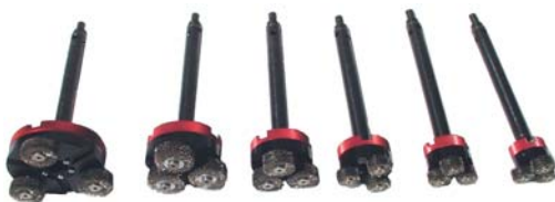
IR Cleaning brushes