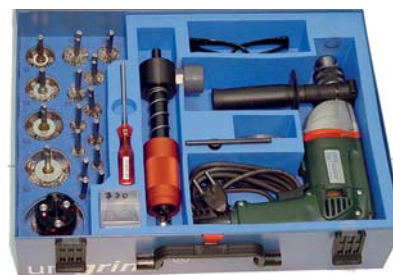
IR transport box with accessories