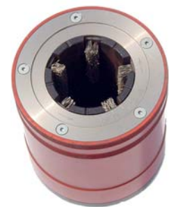
AR Adjustable cleaning head