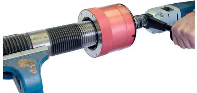
AR male thread cleaning head