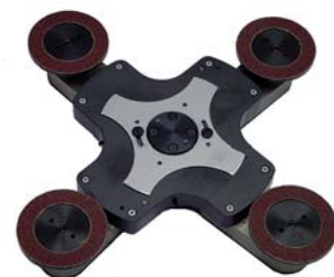
SHS 600 planet disk