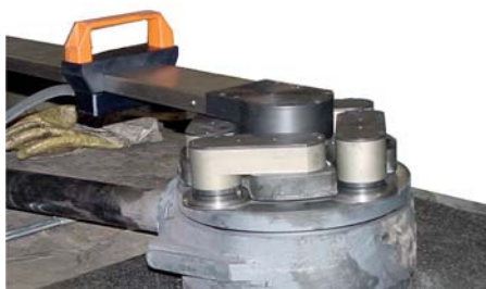
SHS 600 grinding of gate valve wedge