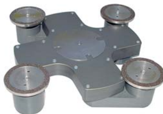
SHS 600 planet disk